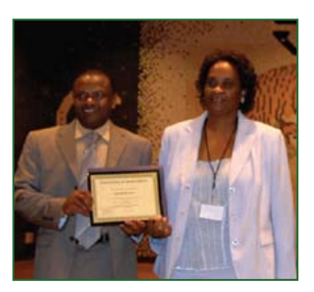
DeWanda Hamler Carroll Jr. High