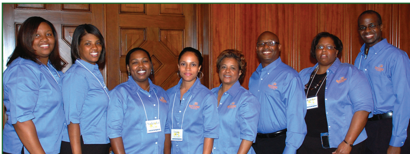
Southern University - Project MISE