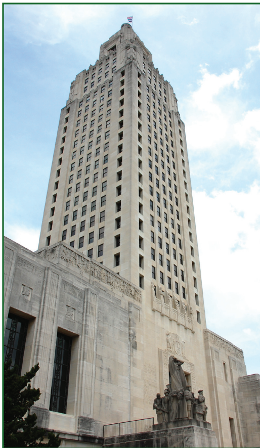
Louisiana State Capitol